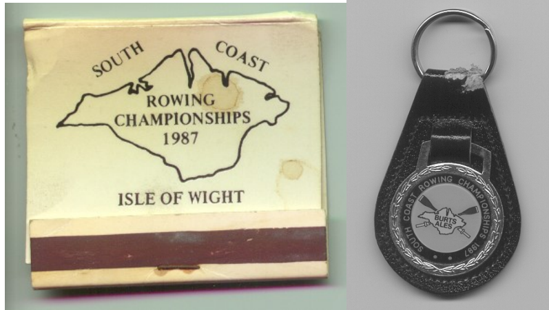
A promotional box of matches from the 1987 Regatta plus – and the key ring given to all competitors at the event.