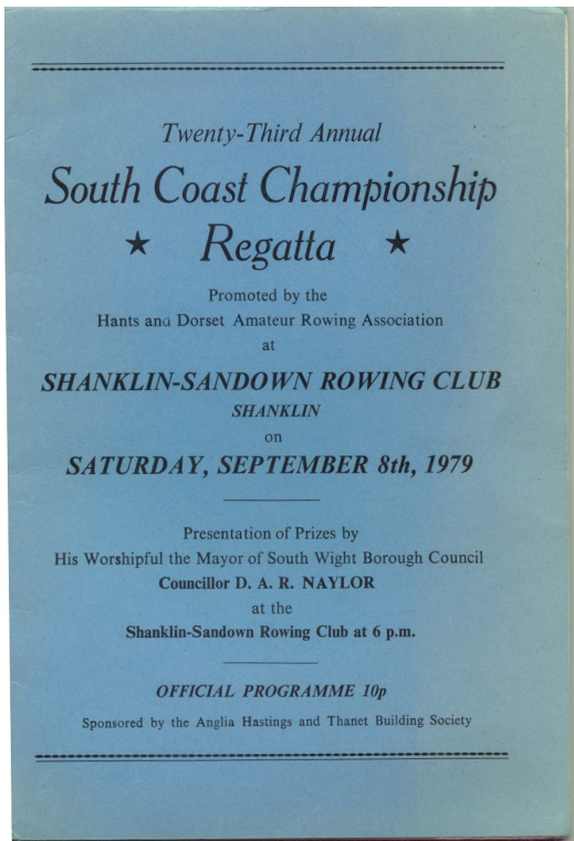
The cover of the 1979 South Coast Championship Regatta Programme staged at Shanklin, I.W and organised jointly by Ryde and Shanklin Rowing Clubs.