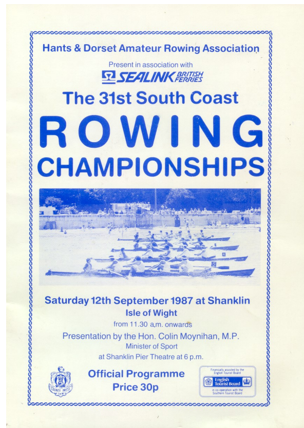
The regatta sponsorship by Sealink led to their sponsorship of the Ryde Club – continued by Wightlink IW Ferries after their takeover.